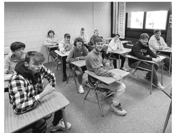
Juniors and seniors have visited the following colleges this fall: Siena and Castleton. More trips are planned for the spring.